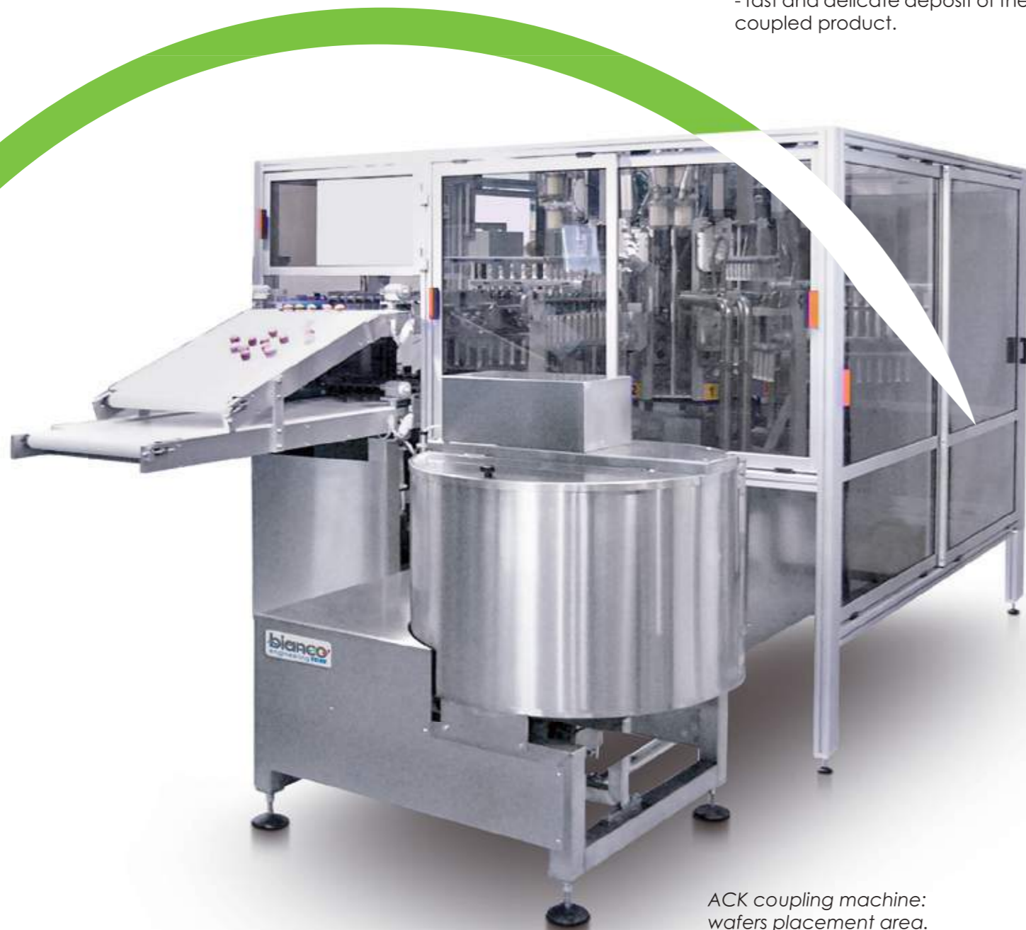
ACK coupling machine: wafers placement area.