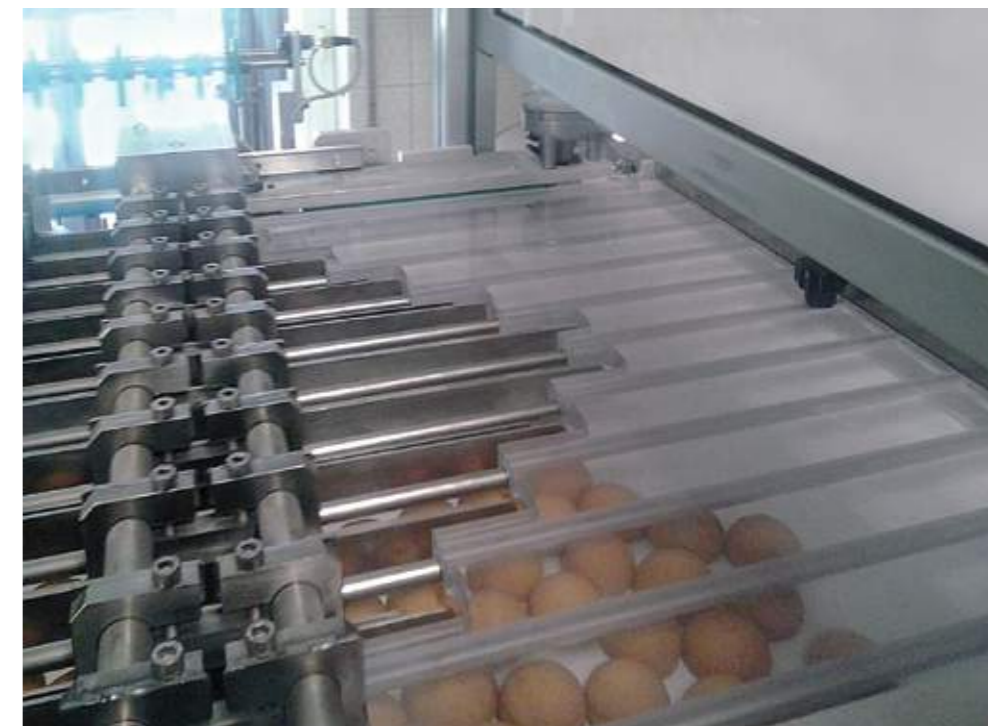
ACK coupling machine: wafers timing area.